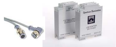
Light includes LDM DIN rail mount constant current driver and 4 meter cable

EXAMPLE: 3.5" Ring Light with RED 630nm LED's Part# RL3.5-630